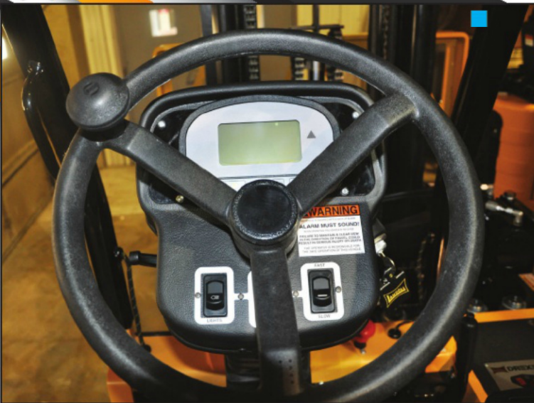
Dash Display with Full Diagnostics, Hour Meter and Battery Discharge Indicator