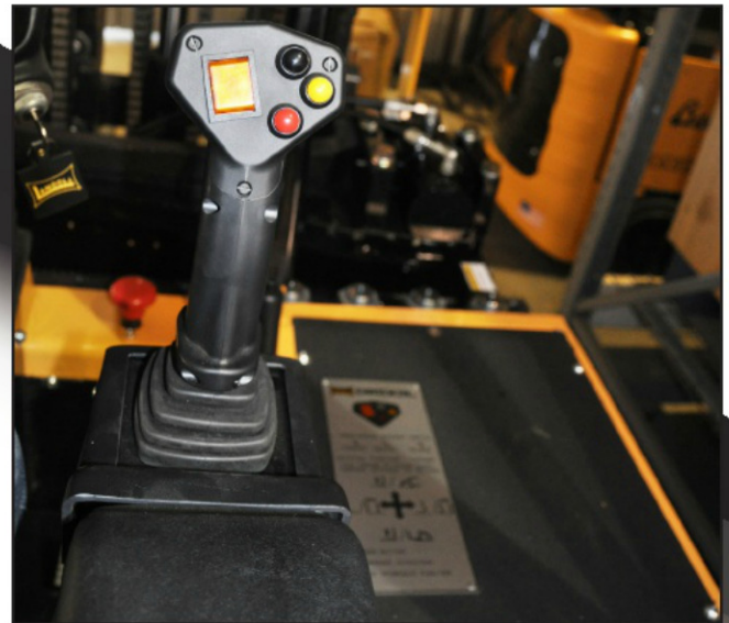
Single Joystick Controls for All Hydraulic Functions, Directional Control and Horn