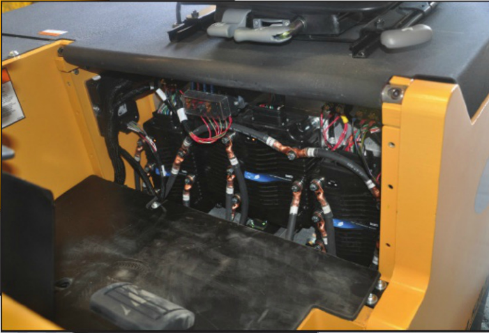
Removable Cover Provides Easy Access to All Control Components