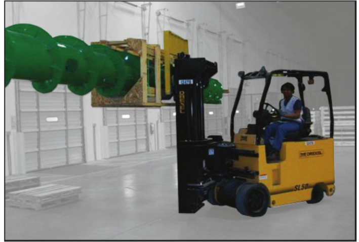
Long Load Handler