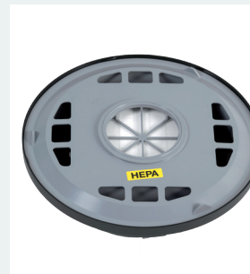
Upstream HEPA filter